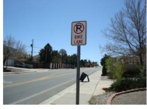
Figure 4: Signage Examples

In Albuquerque, most on-street facilities have standard bikeway signage, and some multi-use trail facilities have entrance monuments. There is currently little directional signage provided along bikeways in Albuquerque. Most local street connections, continuous bikeway routes, and destinations are not identified. Wayfinding is difficult on trails that do not parallel roads, since cross streets and familiar landmarks are sometimes difficult to use as reference points. An important area of concern is the inability to readily identify a location on the multi-use trails for emergency response purposes.