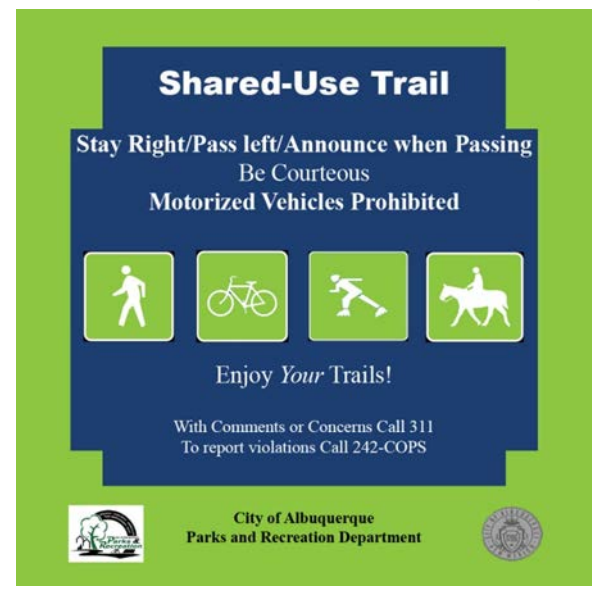
Figure 2: Trail Etiquette Signs

The City aims to address these user conflicts in three ways: 1) develop new facilities to meet the minimum design standards and guidelines to improve the safety of the trail or bikeway, 2) inventory, evaluate, and then retrofit design enhancements for facilities that do not meet the minimum standards or have high volumes of users, for example adding wide shoulders or a parallel soft-surface path, and 3) educate and promote awareness of trail etiquette and the types of accommodations that are required when there are high volumes of users, such as slower speeds and more communication between users. Current problem areas on multi-use trails have signage and graphics indicating who is supposed to yield to whom.