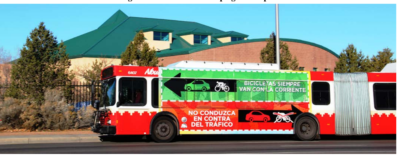
Figure 6: Educational Campaign Example

Because most of the on-street locations were signalized intersections, the violations at these intersections were running red lights. Few cyclists were seen running a red signal indication without first stopping at the approach. The second most common violation was riding on the wrong side of the street in a bike lane. In 2014, the City prepared an education campaign to address this issue by providing billboards on ABQ Ride buses that were targeted at bicyclists, Figure 6 .